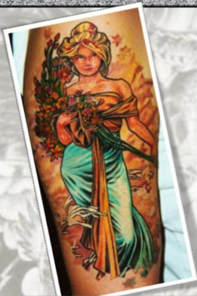
Art Escobar, www.Real-Tattoo.com