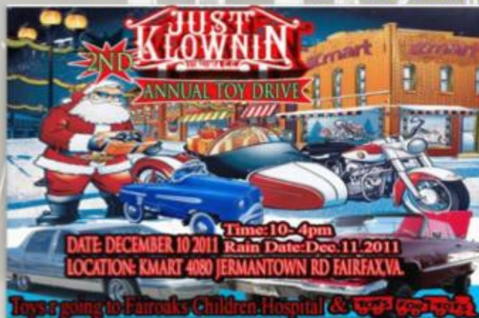
Flyer created by Casper Produccionz